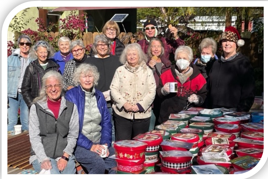
Preparing to deliver Thanksgiving lunches and cookies for Christmas